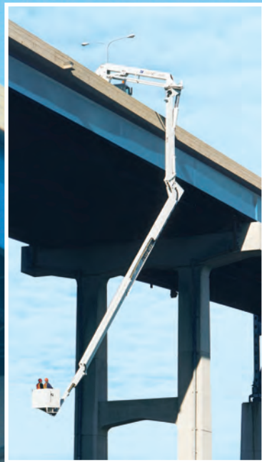
• 85' VERTICAL REACH