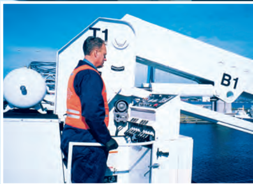
• INTEGRATED CONTROL CONSOLE